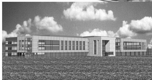
OPN Architects designed the Wells' Dairy corporate center with offset sections: the one-story section represents the pilot plant, the next section is the research and development area, the central wedge shape is the main lobby entrance to the three-story office wing and serves a circulation point to the other sections.