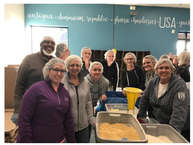
Members of the bureaus of <u>Oral Health & Delivery Systems</u> (pictured) and <u>Family Health</u> volunteered recently to package meals for <u>Meals from the Heartland</u>.

Since July 2017, staff have approved 44 new food products. The new process continues to be tested, but it is off to a great start.