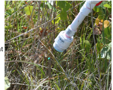
Figure 3. Closeup of the herbicide applied on the cut stem with the stump stick.