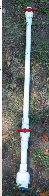
Figure 1. Stump stick used for applying herbicides to cut stumps.

Frequent mowing without herbicide treatment is another method for control of volunteer trees. One advantage of using a rotary brush mower is that if the planting is large and volunteer tree density is high, a lot of area can be covered in a short amount of time. The best time to cut the trees is when they are in flower when their root reserves are at the lowest. Trees also need to be mowed more than once in a growing season (Wisconsin Dept. of Natural Resources 2013). Unfortunately, mowing when trees are flowering typically coincides with nesting activities and the flowering of many species of forbs. Even when trying to minimize the impact to the flora and fauna by selectively mowing only the highest density areas of volunteer trees, I've personally found it difficult to rid plantings of trees by this kind of mowing.