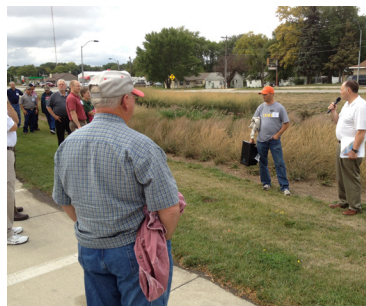
Storm Lake Watershed Project field tour.

Iowa's 27th Annual Roadside Conference took place Thursday and Friday, September 19 and 20 at King's Pointe Resort in Storm Lake, Iowa. The conference is organized by the Roadside Program at the University of Northern Iowa and the Association for Integrated Roadside Management (AFIRM). It attracts county roadside managers, engineers, weed management experts and prairie enthusiasts from throughout the Midwest for training and networking with other professionals in the industry. Nationwide, Iowa is a recognized leader in the use of native vegetation for roadside management.