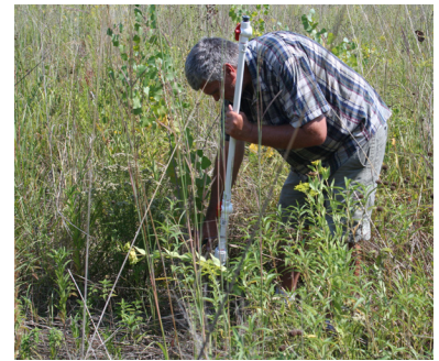
Figure 2. Cutting volunteer cottonwood trees in a 6-year old UNI campus prairie planting. Trees were cut with hand pruner shears and herbicide applied to the cut stem with the stump stick.

Wisconsin Department of Natural Resources. 2013. Invasive species control Factsheet. http://www.dnr.wi.gov/topic/invasives/control.html . Accessed 10/31/13.