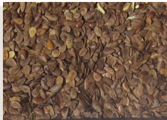
Butterfly milkweed ( Asclepias tuberosa ) in flower (banner photo) and cleaned seed (above).

Read more: Monarch Joint Venture, U of MN, St. Paul, MN. http://monarchjointventure.org/ Xerces Society, Portland, OR. http://www.xerces.org/