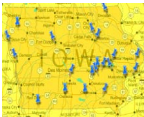
Counties that are served by Community Foundations in the state of Iowa

Use this Web site to find out more about joining this statewide network, making donations or obtaining grants. Click on Membership Information to apply for membership on-line or to use our on-line membership directory and contact one of Iowa's foundations or charitable giving organizations.