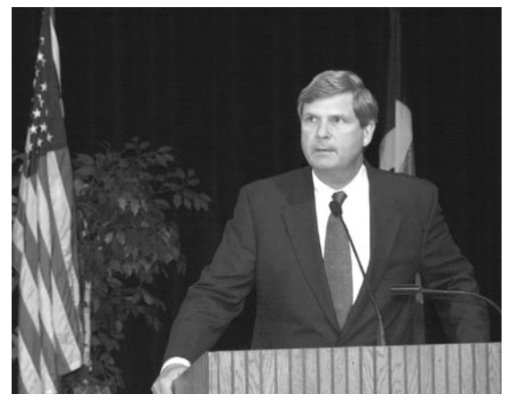
Governor Vilsack addresses participants at the IIOF Symposium

e need to place a very targeted focus on the bioeconomy" was one of many key statements made by Governor Tom Vilsack as he summed up the theme of presentations made at the Iowa Industries of the Future (IIOF) Biobased Products and Bioenergy Symposium held September 4, 2002, in Ames. The event was sponsored by the U.S. Department of Energy, Iowa State University Extension, the Iowa Energy Center, the Biorenewable Resources Consortium, and the Iowa Department of Natural Resources.