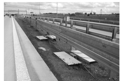
FHWA microsite to assist in increased accessibility to state guardrail data.