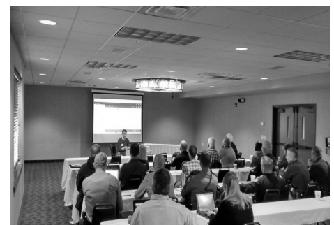
2016 Local Road Safety Workshops, from left to right: Fort Dodge, Iowa City, and Sioux City, Iowa