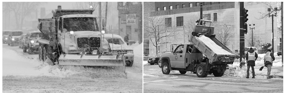
Plowing and the distribution of salt on roadways are time-proven methods in ice removal.

Salt bounce and scatter continued on page 3