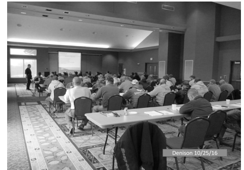
2016 Excavation Safety Workshops, from left to right: Iowa City, Ames, and Denison, Iowa