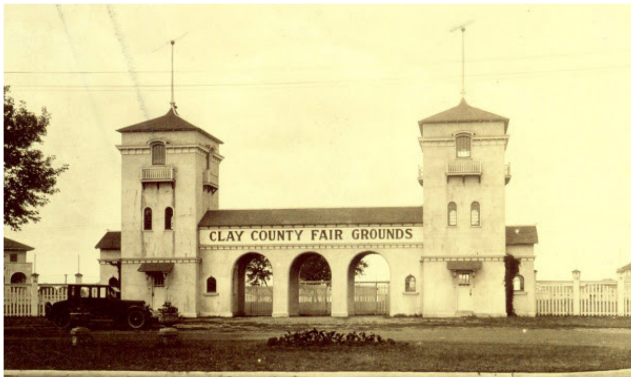
Iowa's 'Other' State Fair is 100 Years Old

Are you interested in National History Day? Participating students apply critical thinking skills and use research methods to create a project incorporating this year's theme – Conflict and Compromise in History. This year's kickoff will introduce the theme with a panel about Iowa's controversial transition from six-on-six basketball. Register by September 29 to attend.