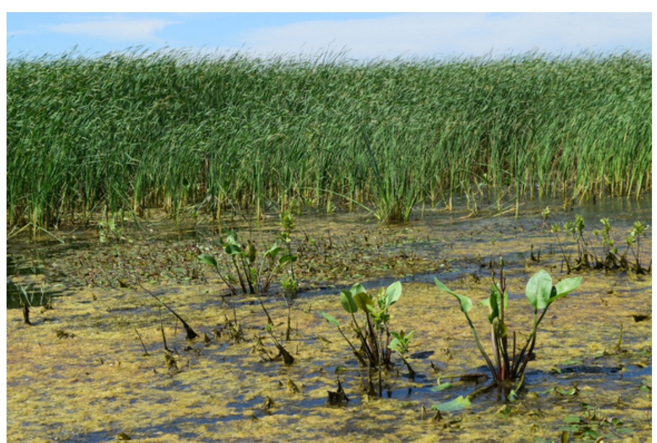
Small, seasonal wetlands have returned to the Eagle Lake area, serving as nesting habitat for ducks and as a filter for water before it enters the lake.

Media contact: Aaron Johnson, DNR Park Ranger at (402) 980-3929