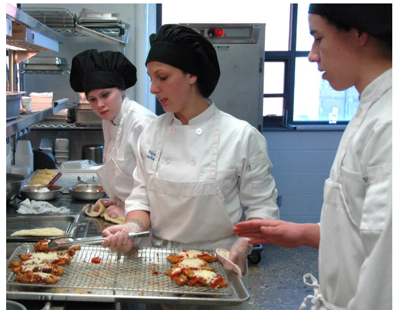
Food is prepared by students from the Culinary Arts and Restaurant Management Program at Des Moines Central Campus.