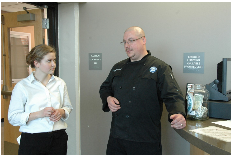
A student talks with the chef/instructor at the Culinary Arts and Restaurant Management Program at Des Moines Central Campus.

The legislation, House File 2392 , builds upon the recommendations released this past fall by the Secondary Career and Technical Education Task Force and marks the first major revision to CTE policy in Iowa since 1989.