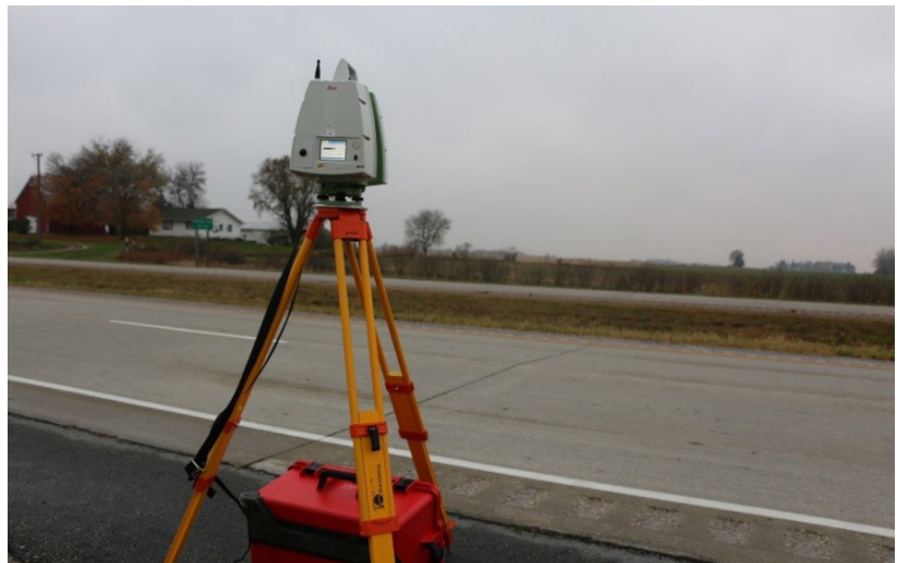
LiDAR device utilized in this study

To better understand curling and warping behavior of PCC pavements in Iowa, research efforts are needed to collect data from Iowa pavements and document the true degree of curling and warping.