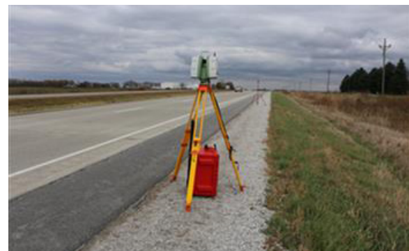
Field investigation of concrete pavement systems on US 30 near Ames in Story County, Iowa