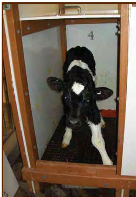
Calf warming boxes designed by the Michigan State University dairy team help control the spread of Johne's disease in the calving area.

The Michigan Johne's Disease Control Demonstration Project was a partnership between the MSU College (Continued on Page 4)