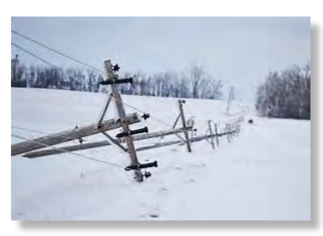
Utility poles damaged by ice storm

An April 2013 ice storm caused millions of dollars in damage to electrical utility