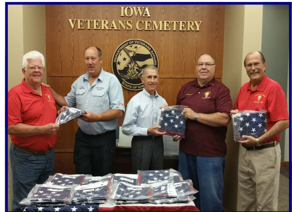
The Knights of Columbus recently donated 150 flags for the Avenue of Flags at IVC. Thanks for ALL of your volunteer work and donations!

The Iowa Veterans Cemetery reports that through October 21, 2015, there are: