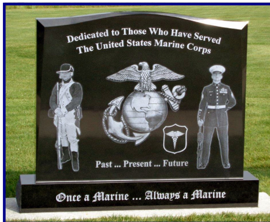
The United States Marine Corps monument is the newest addition to the Walkway of Honor at Iowa Veterans Cemetery