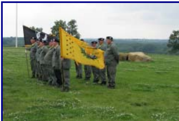
Post 790 Vietnam Veterans of America