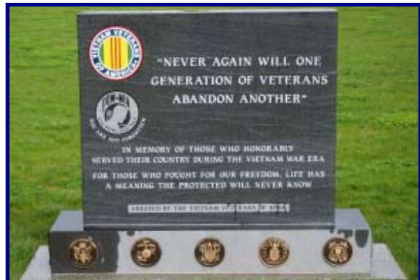
VVA's New Monument