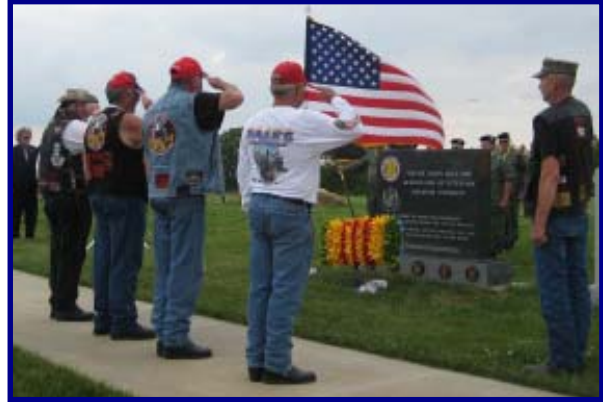
National Veterans Awareness Organization