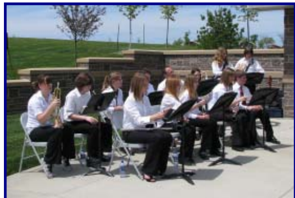
Van Meter High School Band