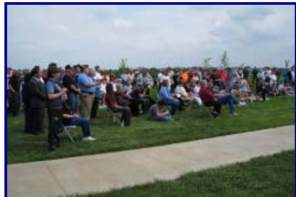
An attentive crowd at the May 23 rd , 2010 dedication