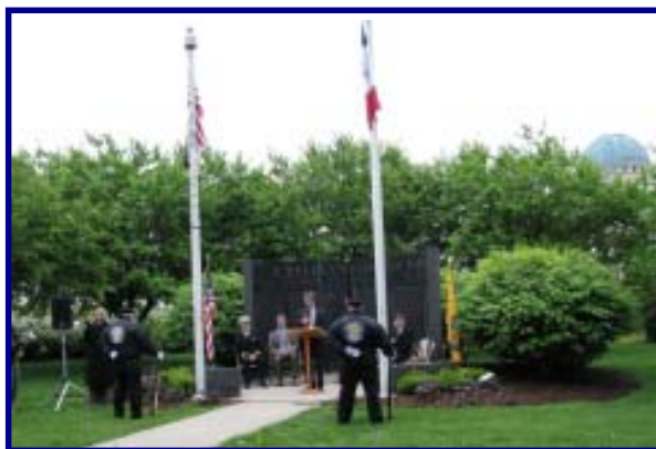
Chapter 790 Vietnam Veterans of America