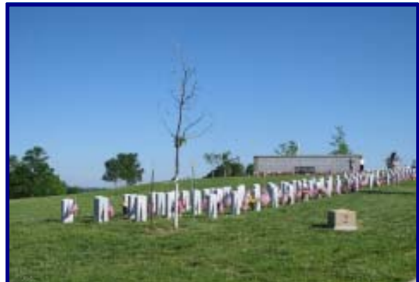
View of Iowa Veterans Cemetery on Memorial Day