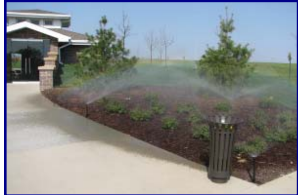
Spring 2010 finally arrives at the Iowa Veterans Cemetery...

The Iowa Veterans Cemetery reports that through May 2010 they have: