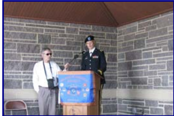
Brigadier General Janet Phipps, Iowa Army National Guard

View a short video clip of the ceremony at: http://iowasurveyor.blogspot.com/2010/05/capt-james-o-perrine.html