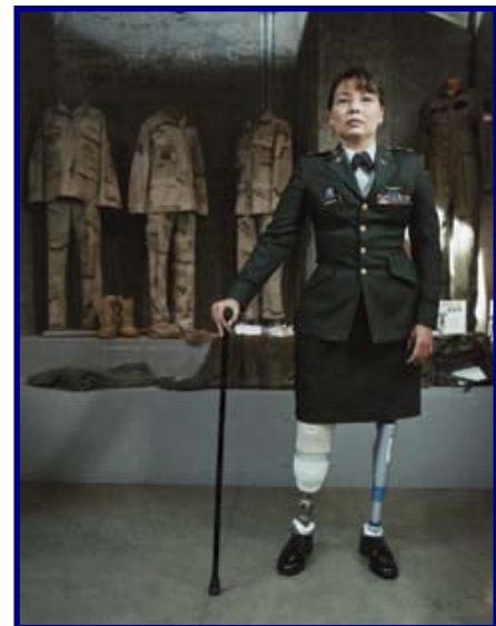
Major Tammy Duckworth

Since her recovery at Walter Reed, Duckworth has dedicated her life to public service and advocating on behalf of disability rights and veterans.