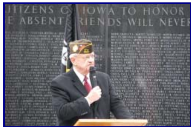
Congressman Leonard Boswell addresses the crowd during the Vietnam Veterans Day ceremony.