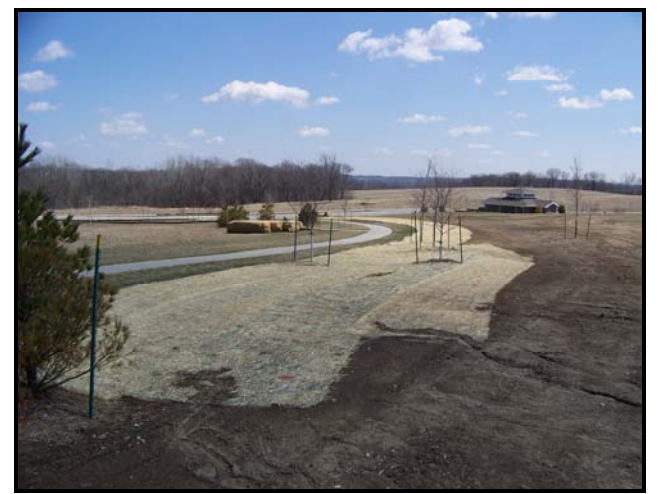
Seeding along the walkway toward the Committal Service Shelter

Another affected area has been along the sidewalk that runs from the administration building south to the Committal Service Shelter. Seeding and matting has been applied along these troubled areas.