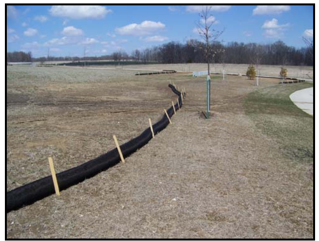
Additional attempts to control erosion near the administration building

Another affected area has been along the sidewalk that runs from the administration building south to the Committal Service Shelter. Seeding and matting has been applied along these troubled areas.