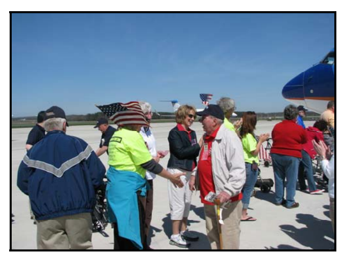
Volunteers hugged and thanked lowa World War II veterans as they arrived in Washington, DC

The plane arrived at Dulles International Airport and as the veterans deplaned, they were greeted by twenty Honor Flight volunteers from Washington, DC.