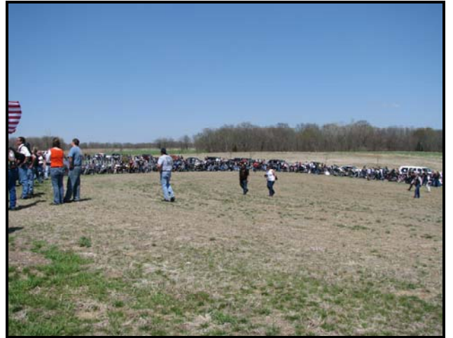
Hundreds of motorcycles at the funeral of seven lowa

The veterans interred on April 24<sup>th</sup> were: