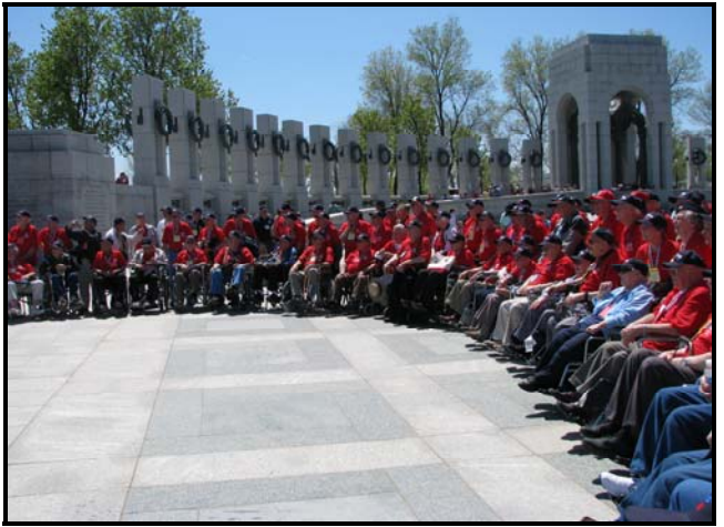
Iowa Veterans at THEIR Memorial!

Immediately upon arriving, the veterans were bused to the WWII Memorial on the Capitol Mall.