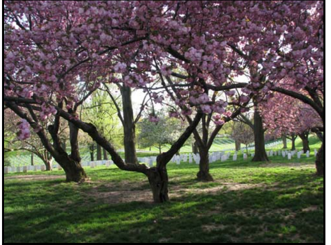
Blossoming trees shade the graves of American patriots at Arlington National Cemetery