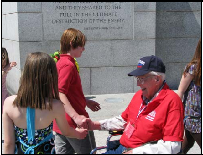
Complete strangers on several occasions approached the lowa veterans and thanked them for their service. This was one of the most emotional parts of the trip.