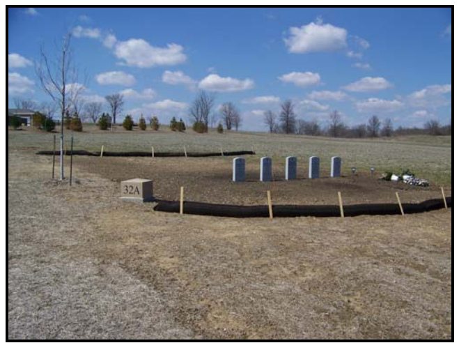
Erosion control methods surrounding newly placed headstones

The department is in the process of obtaining bids from seed vendors and plans to seed the affected areas. Both Dallas County and the lowa Department of Transportation (lowa Roadway Trust Fund) have stepped up to assist staff. They have donated money, time, and product to combat erosion.