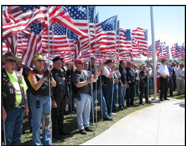
Hundreds of flags were carried by those in attendance