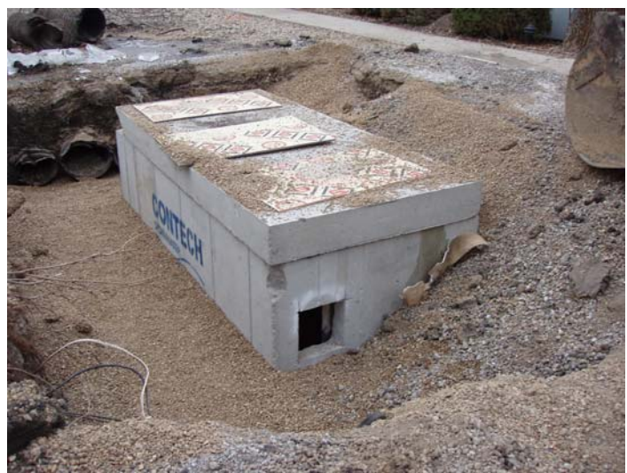
Grit Collection Chamber (Site H8)