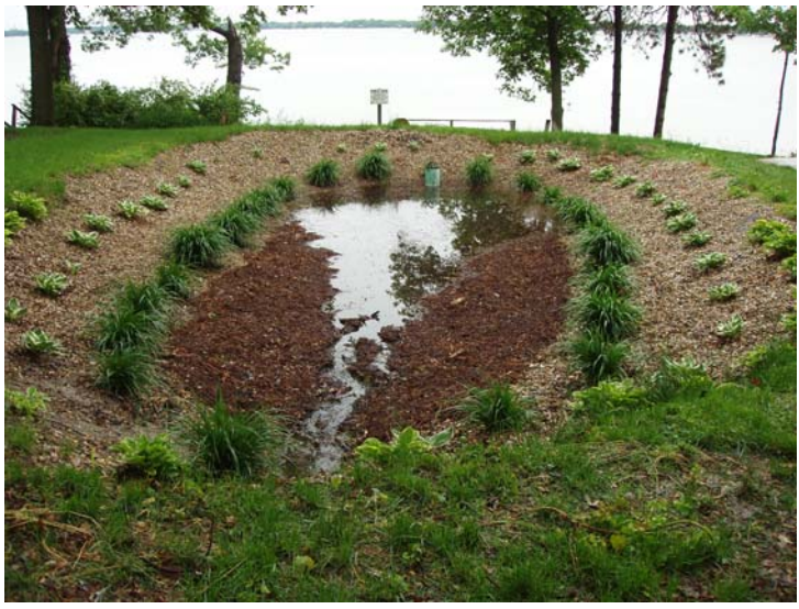
Rain Garden (Site F5)