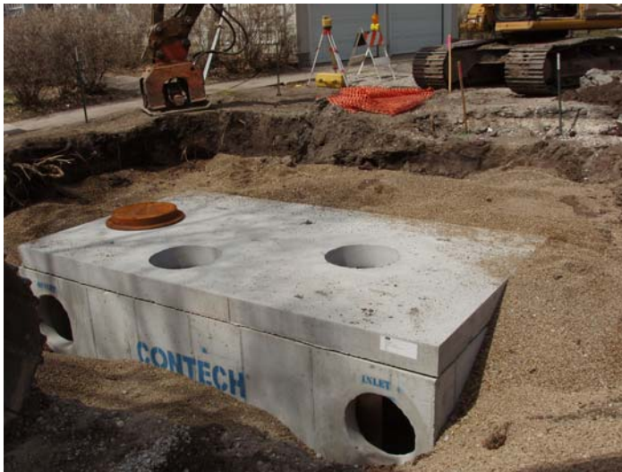
Grit Collection Chamber Installation