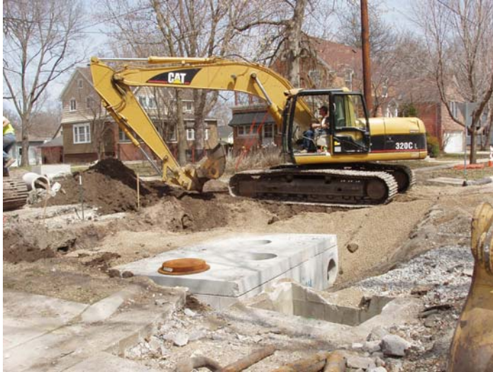
Grit Collection Chamber Installation