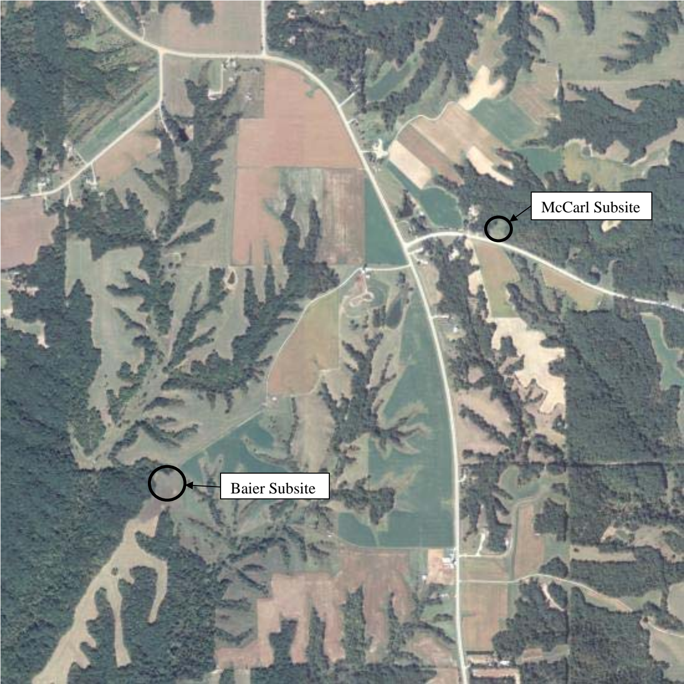
Figure 1: Site Map