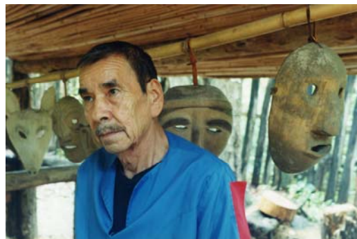
American Indian and Alaska Natives in Iowa by Selected Tribe: 2010

Number of American Indian areas in Iowa, which include the Omaha, the Sac and Fox/Meskwaki, and the Winnebago. The Sac and Fox/Meskwaki Settlement is the only one in Iowa with residents, totaling 1,062 in 2010.