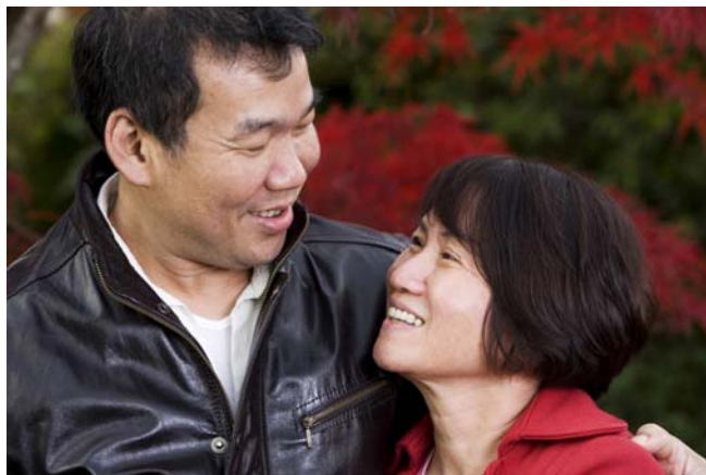
Iowa's Asian Population: 2007

The number of Iowa residents in 2007 who were born in Asia. Asian-born residents comprise 29.6 percent of the state's total foreign-born population.