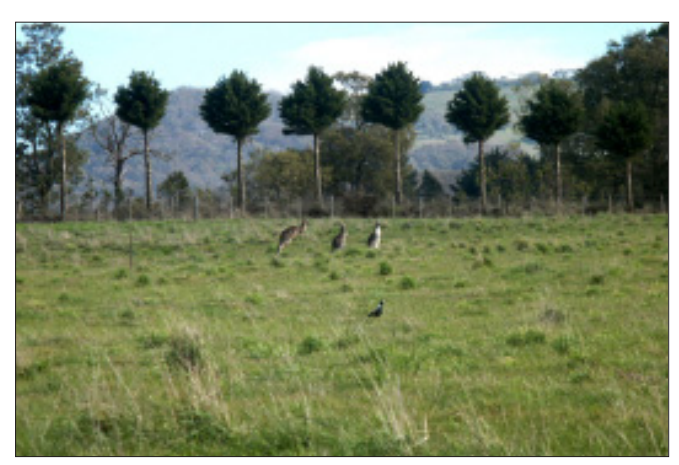
In spite of the differences between Australian agriculture and lowa agriculture, farmers face many of the same problems.

If an agriculture that receives large amounts of direct, commodity support experiences the same kind of problems as an agriculture that receives no support at all, we need to reconsider our position. We should be searching for alternatives if we want government commodity support to address these problems.