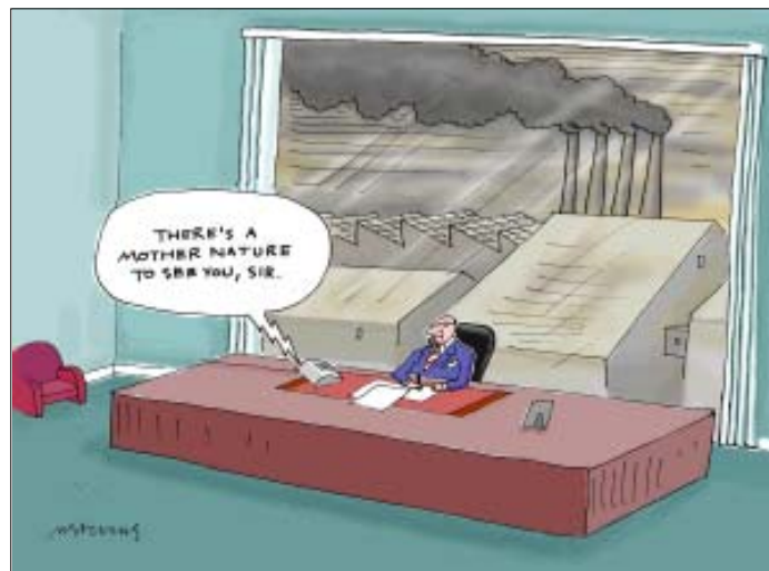
© 2002 The New Yorker Collection from cartoonbank.com. All Rights Reserved.

either. Factories also push the limits imposed by the depletion of fossil fuels and by the environmental damage stemming from that system. Recognizing this, the Ford Motor Company recently invested $2 billion to install a “living roof” on its factories, planting it with sedum plants and installing wetlands. This has turned the roof into a “ten-acre garden” expected to lower energy costs, reduce the need for artificial light, and filter water for reuse in the factory. The Ford Motor