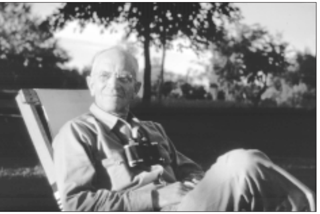
Aldo Leopold's words still ring true in new collection of previously unpublished essays.