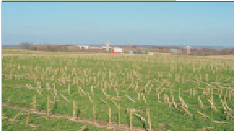
Top: Staff from NRCS and the National Soil Tilth Laboratory visit an Allamakee County test plot of a rye cover crop.