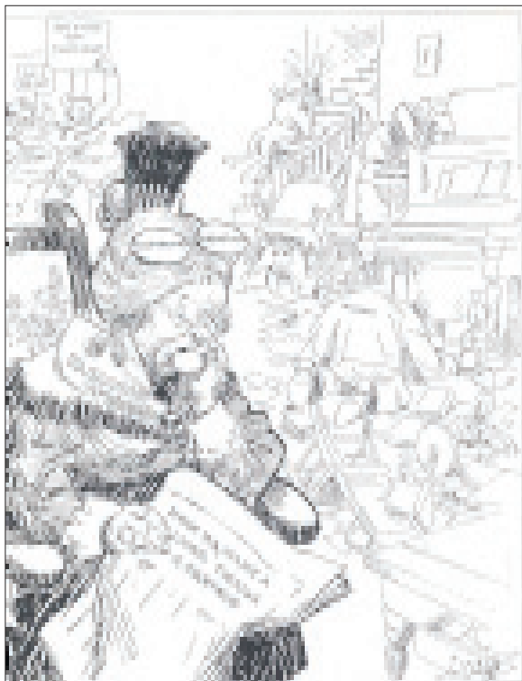
“Looking for Grandma’s Spectacles,”

So how do we address this age-old problem? There are at least three avenues we could pursue and they are not mutually exclusive.