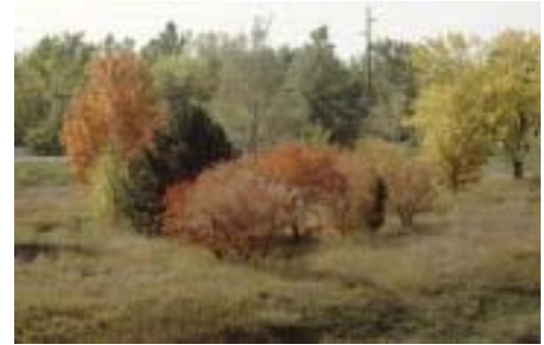
Roadside plants provide a variety of shapes, colors, and sizes to break up the landscape, and decrease highway hypnosis.