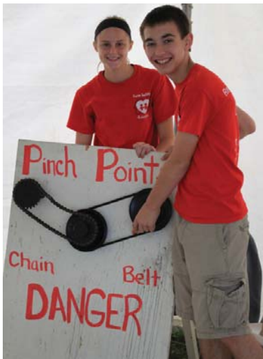
FFA students with the Red Brownville FS4JK Chapter demonstrate pinch point safety at Farm Fest in Gilfillan, MN.

FS4JK is working with the Central States Center for Agricultural Safety and Health to identify the differences in risk perception and preferred communication channels among farm demographic groups. Surveys, interviews, and focus groups are taking place to categorize this information. FS4JK also worked with the University of Missouri on a project, funded by Great Plains Center for Agricultural Health, encouraging people to blog about farm safety and health issues.