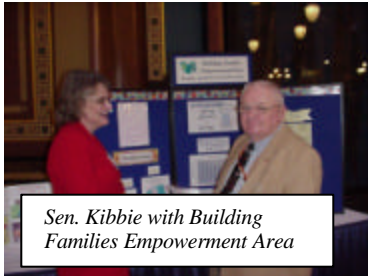
Sen. Kibbie with Building Families Empowerment Area

Early childhood advocates created a strong voice for Iowa's youngest citizens while at the Capitol on February 5, 2003. Over 55 displays and many delegates from across the state shared their message about the importance of supporting early childhood investment in our state.