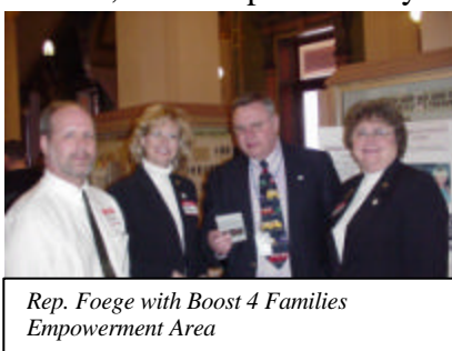
Rep. Foege with Boost 4 Families Empowerment Area

Overall, it was a positive day at the Capitol for supporting early childhood initiatives in Iowa.