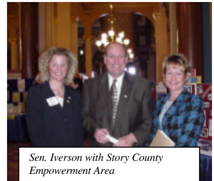
Sen. Iverson with Story County Empowerment Area

Early childhood advocates created a strong voice for Iowa's youngest citizens while at the Capitol on February 5, 2003. Over 55 displays and many delegates from across the state shared their message about the importance of supporting early childhood investment in our state.