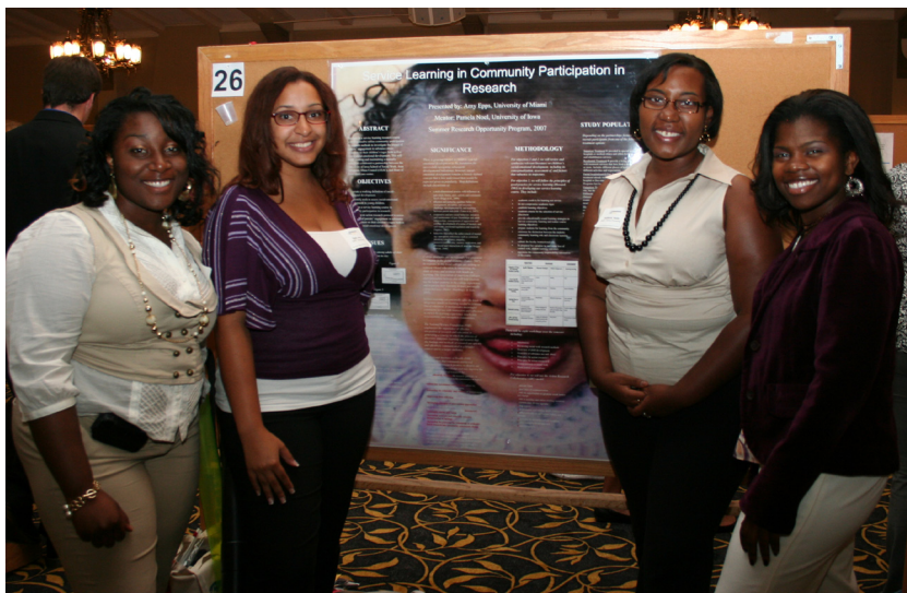
Summer Research Opportunities Program students presenting a research poster at the 2007 Graduate College Summer Undergraduate Research Conference held at the UI.