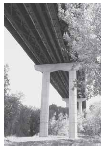
The U.S. 20 Iowa River Bridge was recently awarded a National Partnership for Highway Quality's National Achievement Award. The bridge, located near Steamboat Rock, was completed in 2003.