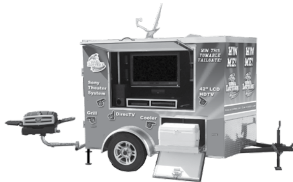
Representative of prize, not actual prize.

Enter non-winning tickets Aug. 29 - Dec. 6, 2011 for another chance to win