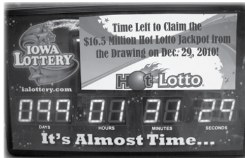
The countdown clock at the Lottery's headquarters shows time left to claim the $16.5 million Hot Lotto jackpot from Dec. 29, 2010.

To help draw attention to the unclaimed jackpot and its approaching deadline, the lottery has installed a countdown clock at its headquarters office in Des Moines and programmed a countdown clock that people can track on its website at www.ialottery.com .