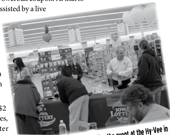
Lottery staff talk to players attending the event at the Hy-Vee in West Des Moines.