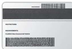
The arrangement of bar codes on a new driver's license (top) looks somewhat different than on an old one (bottom).