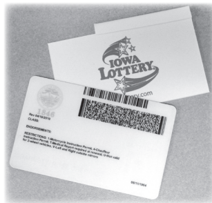
An Iowa driver's license and an Iowa Lottery sleeve to aid in scanning.

The improved materials and features in the newest design have produced longer-lasting cards that are more resistant to fraud and tampering.