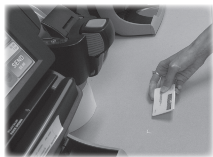
Scanning a driver's license with the Wave terminal