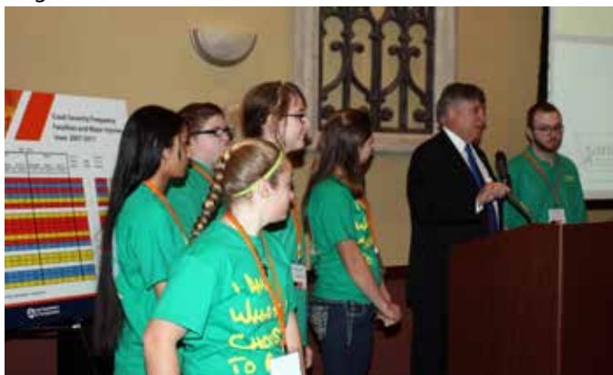
A group of students from Saydel High School was able to join attendees and discuss the program they have started to keep young drivers safe.

To continue this multidisciplinary approach, the Iowa DOT hosted members of the safety community at a workshop Jan. 23 to begin the updating of the state's new Strategic Highway Safety Plan (SHSP), modeled after the original CHSP.