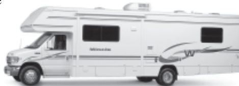
A lucky Iowa Lottery player will win a Winnebago Minnie ® motor home on Aug. 22.

The "Iowa State Fair 150 th Anniversary Sweepstakes" promotion will culminate with a prize drawing Aug. 22 at the Fair to determine the winners of 12 cash