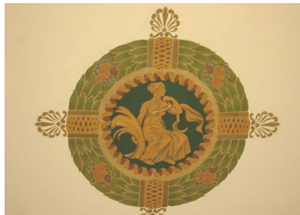
Virgo, The Maiden