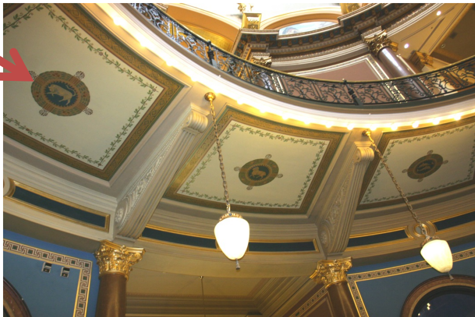
Garnsey's Zodiac Signs, First Floor Rotunda area in the Iowa State Capitol