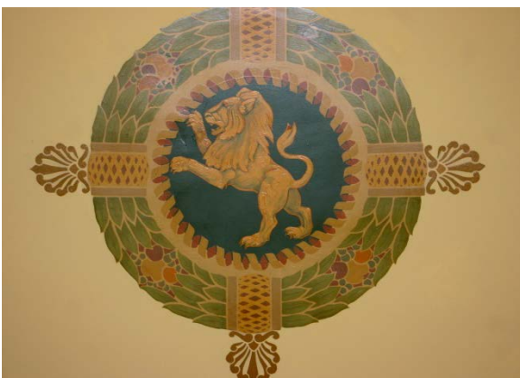
Leo, The Lion