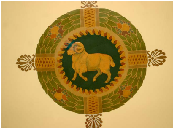
Aries, The Ram