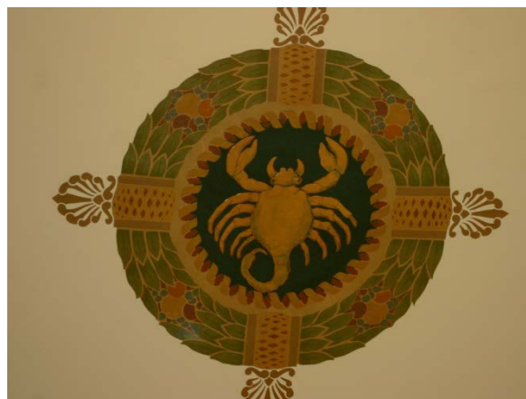
Scorpio, The Scorpion