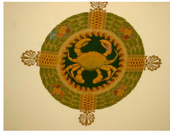
Cancer, The Crab