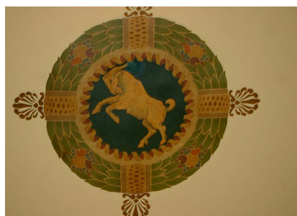
Capricorn, The Goat