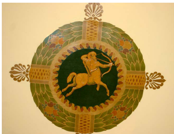
Sagittarius, The Centaur