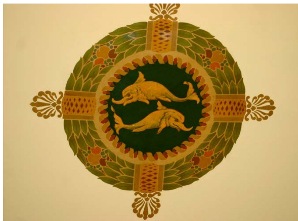
Pisces, The Fishes