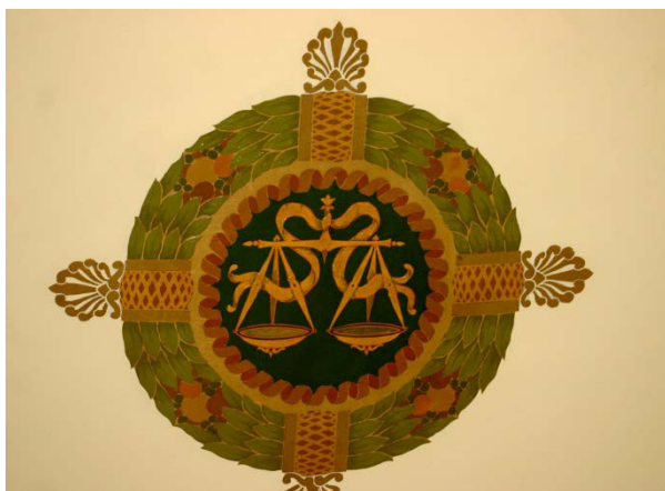
Libra, The Scales