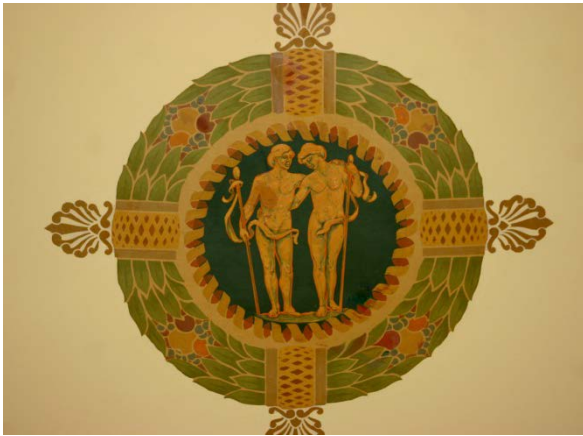
Gemini, The Twins