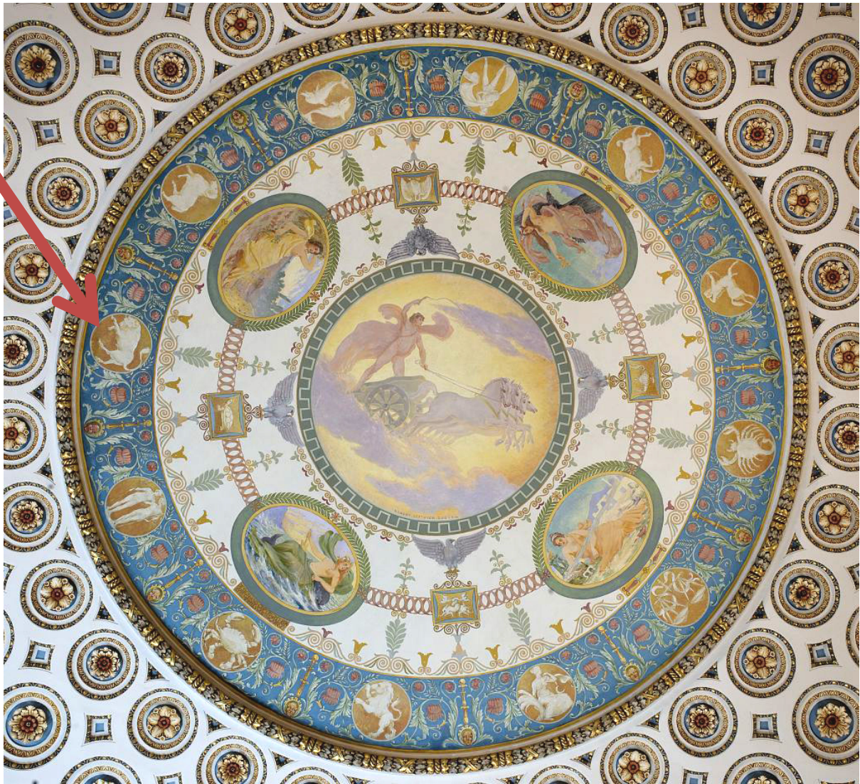
Garnsey's Zodiac Signs, Second Floor, Southeast Pavilion in the Library of Congress