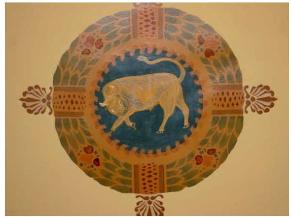
Taurus, The Bull