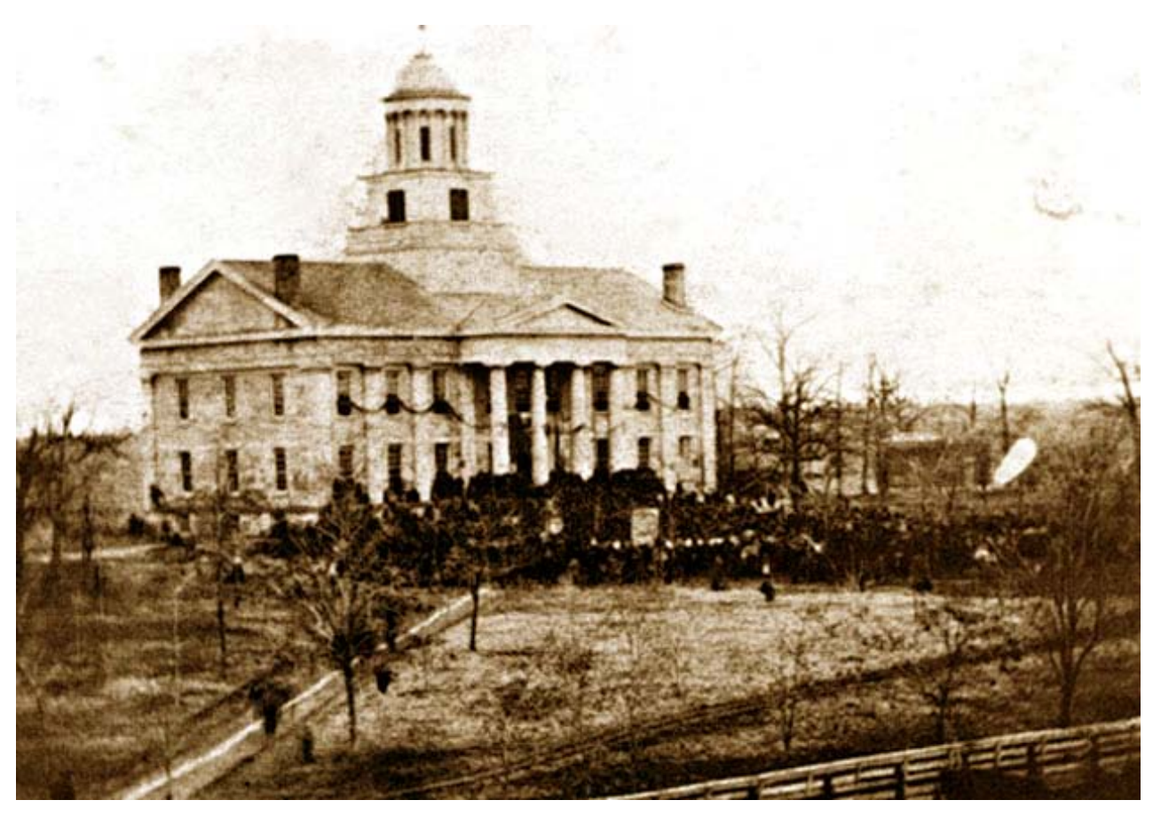
Old Capitol at the State University (now University of Iowa) during the 19th century—Iowa City, Iowa