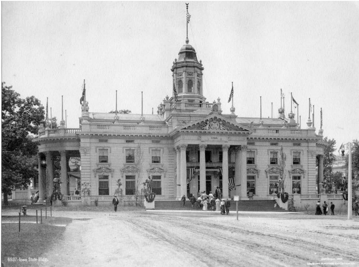
Iowa Building at the Louisiana Purchase Exposition in Saint Louis - 1904