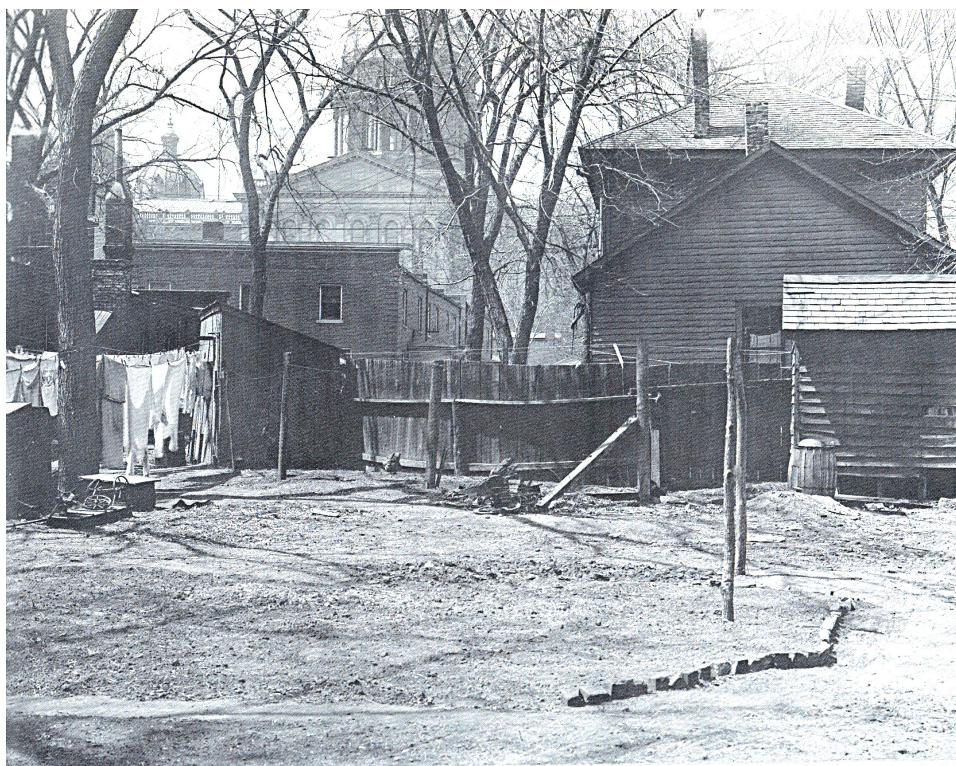
Another view east of the Capitol grounds and in the vicinity of building site if office building is ever constructed.