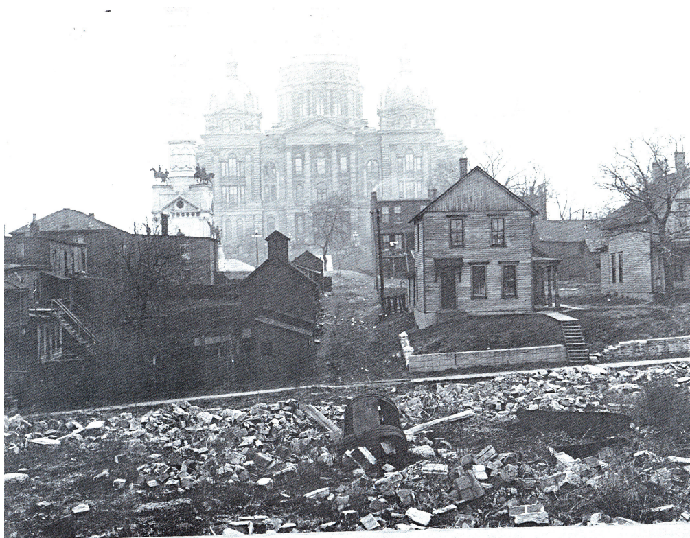
Another view to the south of the Capitol and Soldiers' and Sailors' Monument.