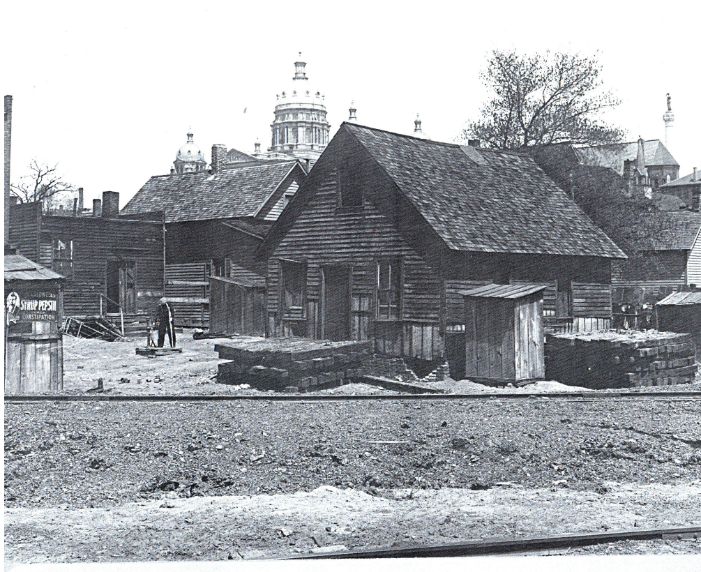
A view of the Capitol from the railway tracks.