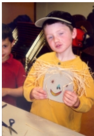
One of many activities held at the Iowa City Public Library in March included a mask-making class.

reading) opportunities for an intergenerational group of learners.