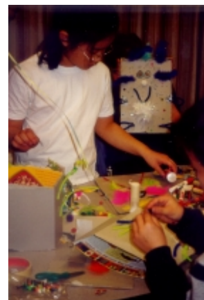
Iowa City mask-making class