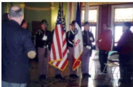
Presentation of Colors - Iowa State Patrol Honor Guard