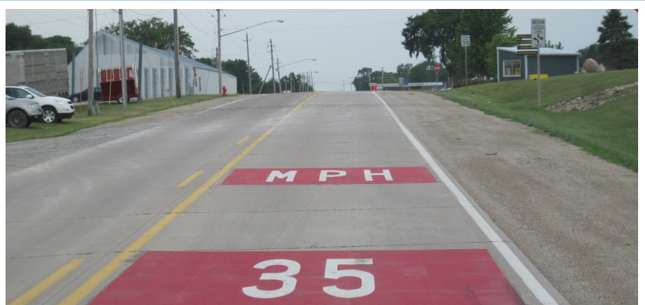
Colored entrance treatment for Jesup east community entrance

Colored surface dressing or textured surfaces are common traffic-calming treatments in the United Kingdom (UK) and are used often in conjunction with gateways or other traffic-calming measures to emphasize the presence