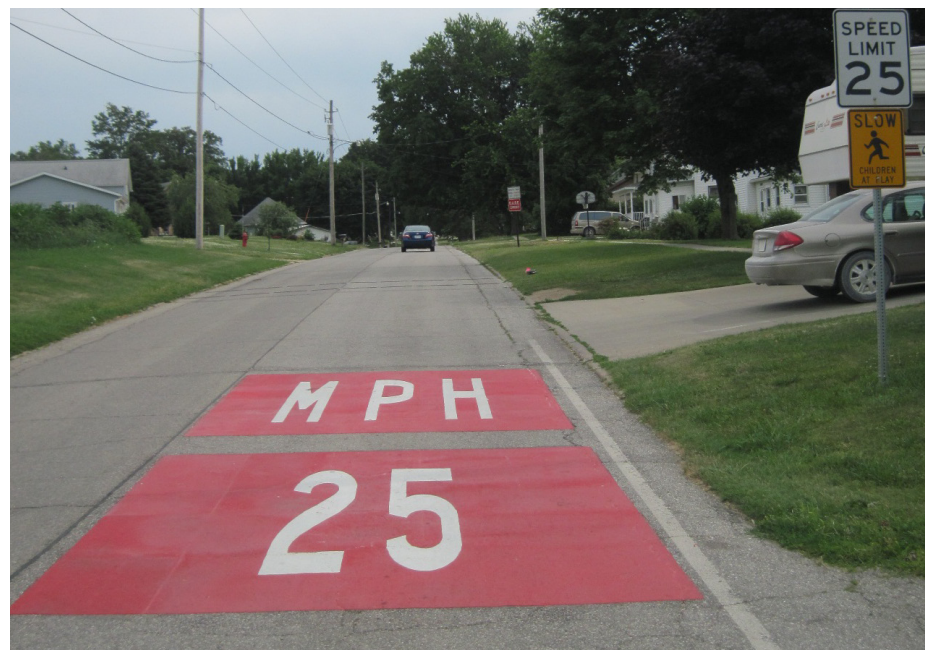
Colored entrance treatment for north community entrance in Ossian

HS counters. Road tubes were typically laid just downstream of the treatment or at the treatment.