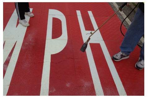
Installation of colored entrance treatment