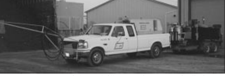
City of Clive crack-filling rig.

time and reduces future road maintenance.