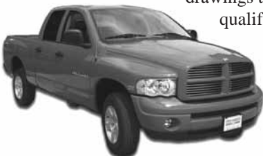
Dodge Ram 1500 truck

qualifiers will be chosen at each of three drawings to be held on July 1, 15 and 29.