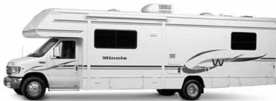
Winnebago Minnie motorhome

A 2005 Winnebago® Minnie® motor home, a 2004 Dodge Ram 1500 pick-up, a Lennox Signature™ Collection