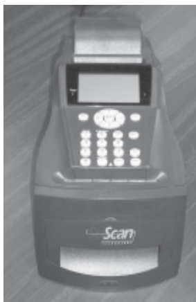
The SciScan can also process coupons quickly.