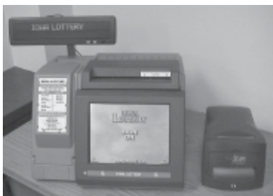
An Extrema lotto terminal processes coupons easily.