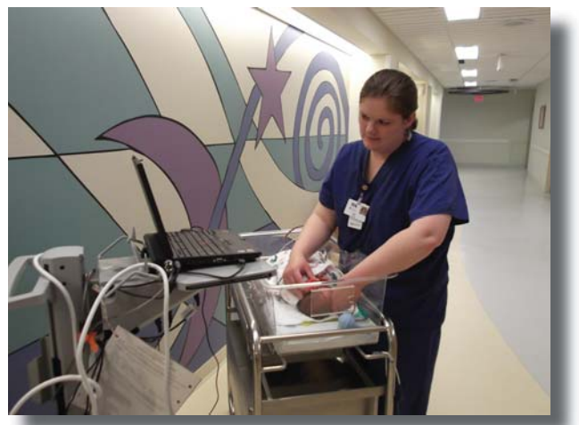
St. Luke's nurse performing screen using new ABR screening equipment.

• Offering to the larger Sioux City area AABR screening to those who would benefit