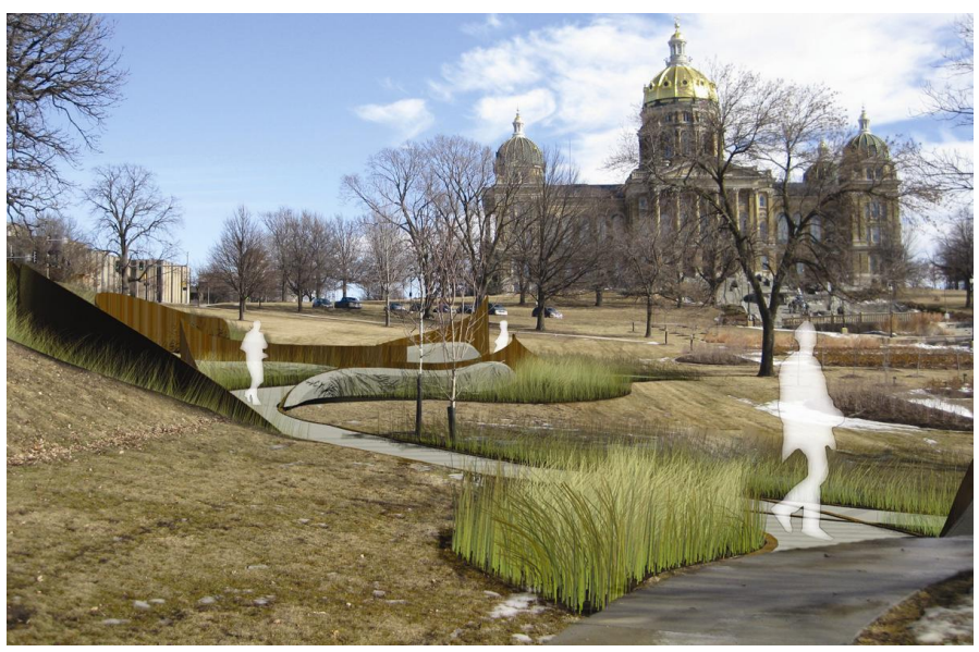
View of the Proposed Holocaust Memorial looking east towards the Capitol

The committee recommended that the proposal team work with DAS as they further refine their proposal, subject to concurrence by the Commission. The Commission subsequently voted unanimously to accept the recommendation of the Site Features Committee. As of this writing, further planning by the sponsor is on hold and no schedule for completion of this memorial has been established.