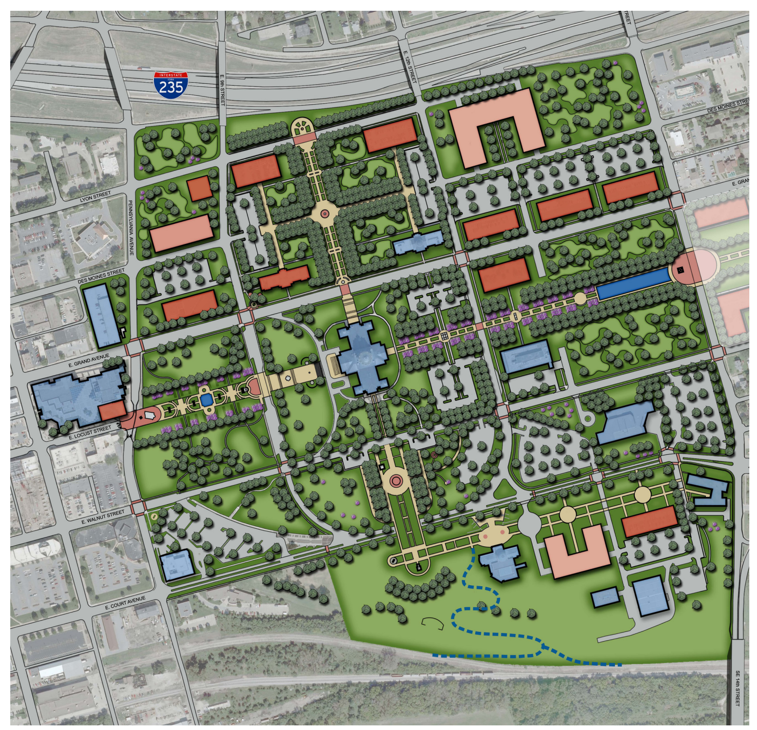
Capitol Complex from the 2010 Master Plan