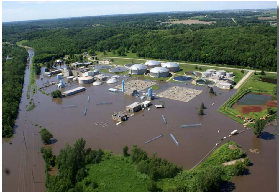
The Cedar Rapids Water Pollution Control Facility during the 2008 floods.

All of the school safe rooms will be multi-purpose rooms to include au-