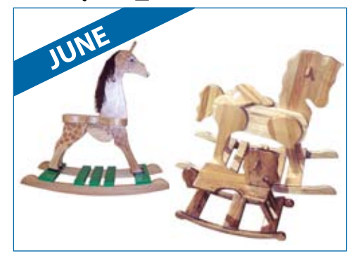
Rocking Animals Regular Price: $40-$85; Sale Price: $32-$68