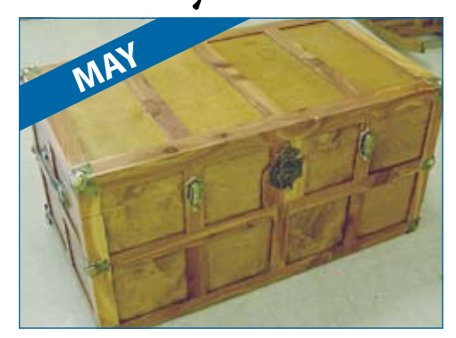
Steamer Trunks Regular Price: $250; Sale Price: $200