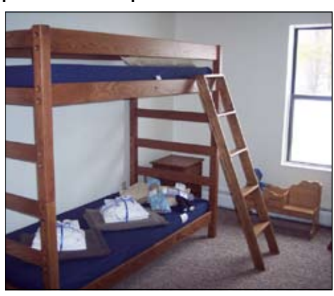
A sample bedroom at Unity Place.