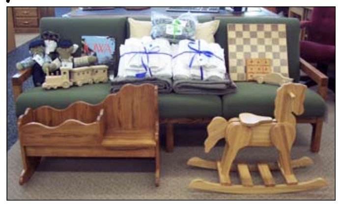
Donated toys to the Unity Place children included rocking horses, dolls and doll cradles, trains, checkerboards and cars. Bed & bath items were also provided for all the apartments.

Iowa Prison Industries is grateful to the Polk County Housing Authority to be given the opportunity to be a part of Unity Place project.