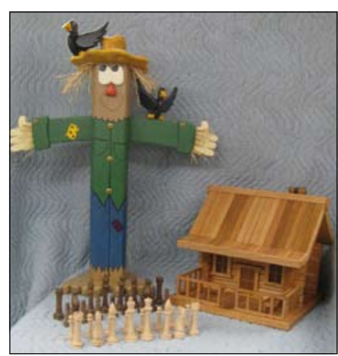
Custom Wood's new novelty items are available to purchase in the IPI Showroom in Des Moines or directly from Anamosa office.

instill a sense of pride to the offender and what they can accomplish. The offender is also allowed to have his picture taken with a finished project that he is particularly proud of. In our slower times, the offenders have been working on a variety of new novelty items.