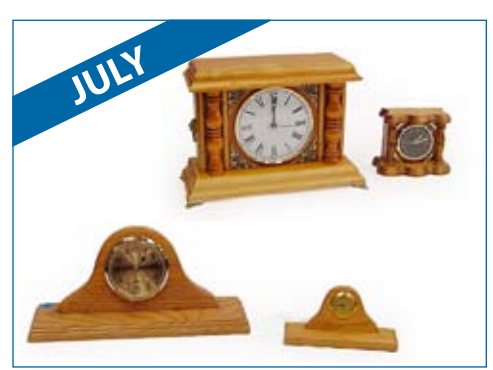
Clocks Regular Price: $17.50-$187; Sale Price: $14-$149.60