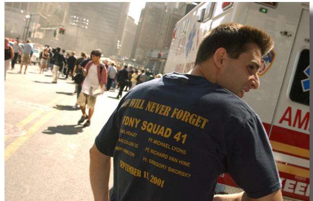
Sept. 11, 2002 - A NY firefighter attends a 9/11 observance at Ground Zero.

National Preparedness Month was created in response to the terrorist attacks of 9/11. As this year marks the 10th anniversary of 9/11, we will remember those lost, honor our first responders, and renew our commitment to prepare and plan for all disasters and emergencies.